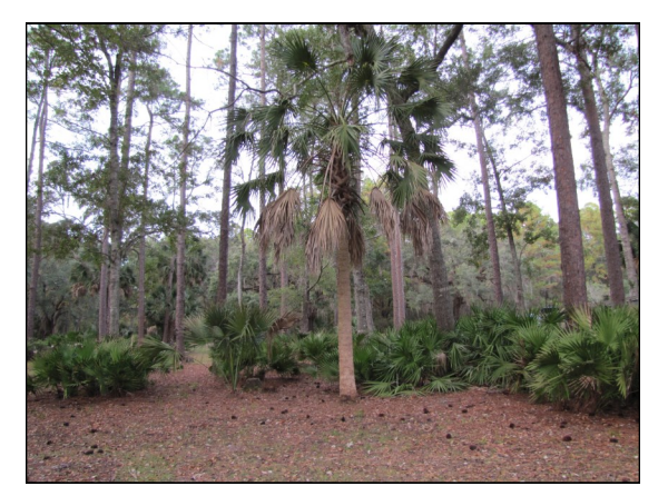
Sabal palm and saw palmettos near the Visitor Center.

Sabal palms will grow almost anywhere and is a popular landscape plant because it is attractive and good for wildlife!