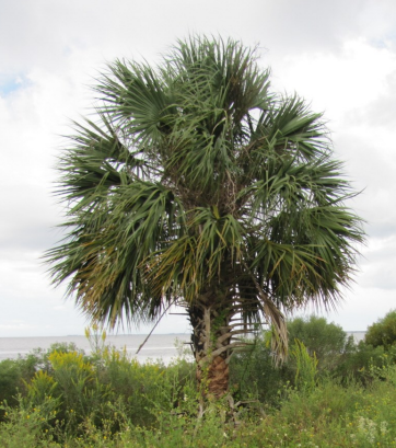
Coastal sabal palm by Scott Davis

Flowers produced during the late spring months extend beyond the canopy and contain thousands of tiny, creamy-white, fragrant flowers that attract an assortment of bees. The palm produces black fruits of about 1/4 inch in diameter in late summer. Although the fruits contain little flesh, they are often consumed by raccoons and other animals that disperse the seeds.